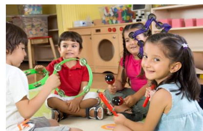
Future rock band

Did you know there are several words for friendship in Hebrew? Two frequently used terms are yedidut and chaveirut . Yedidut connotes a beginning friendship, while chaveirut points to a deeper relationship. How are you telling the story of deepening friendships in the classroom? Write down the moments when two children first notice something they have in common, perhaps over snack or a sparked discussion in morning meeting. Watch and photograph as they begin to play more often with one another. Let families know about growing friendships. Hopefully the families will become friends, too.