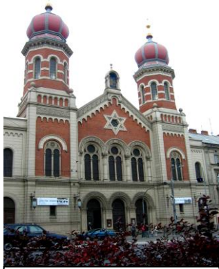
Synagogue in Pilsen, Czech Republic – 3 rd largest in the world.

Community/Kehilla. Judaism values community. Jewish texts repeatedly remind us that every individual is part of a larger group and is responsible for the wellbeing of others. In Pirkei Avot , a compilation of rabbinical writings translated as Ethics of Our Ancestors , we read, “Do not separate yourself from the community” (2:5). The rabbis explain that we should be attuned to the needs of others. Judaism also teaches that when we work together, we are stronger and able to accomplish more than when we work alone. In Ecclesiastes , we find another way to put it: “A three ply cord is not easily broken” (4:12).